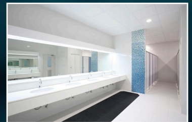
Sure Stride® (Adhesive-Back Matting)