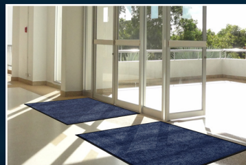
ColorStar® (PET fabric features 100% recycled content reclaimed from plastics)

By preventing contaminants from entering a facility, mats will substantially reduce the need for cleaning chemicals that might be harmful to building occupants and the environment. M+A is committed to developing and manufacturing eco-friendly products, reusing and recycling materials as often as possible.