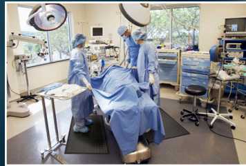
Complete Comfort™ II

Prolonged standing puts pressure on the feet, leg muscles, spine, neck, and shoulders which can lead to chronic pain, injuries, and muscular disorders. By providing employees with anti-fatigue mats in standing areas, it can increase productivity and reduce the pain associated with standing for long periods of time. Standing on an anti-fatigue mat burns calories, reduces energy consumption, alleviates stress to the back and legs, and also reduces fatigue as a whole.