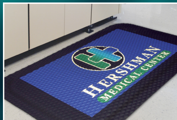
Hog Heaven® Impressions

M+A offers several different logo mat options to display your company's logo and leave a lasting impression on your visitors. Logo mats are recommended for use at entryways, in lobbies, at front desks, or anywhere you want to display your company logo, slogan, artwork, or message to customers/visitors or employees. Photographic quality can be achieved and some styles are available in custom shapes.