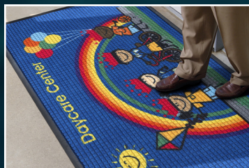
WaterHog Impressions HD®